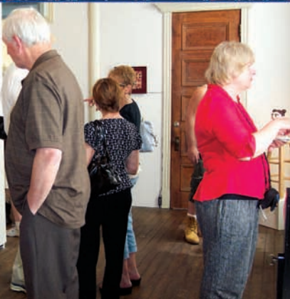
Exhibition | U Mass Dartmouth Artisanry BFA 2010